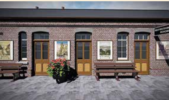
Artist's impressions of the new refreshment building.

The Railway's 2016 Share Offer has funded the bulk of the costs of the Bridgnorth development, but the Charitable Trust is also making a significant contribution. Many people are donating to Bridgnorth through the Trust, and of course this method has the added advantage of attracting 25% Gift Aid at no extra cost to the donor.